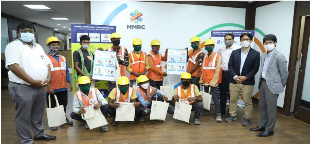
Distribution of Tote Bags, Masks and Soaps at MMRC