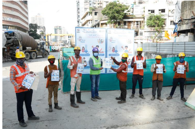
Goods distribution at Dadar Metro Station