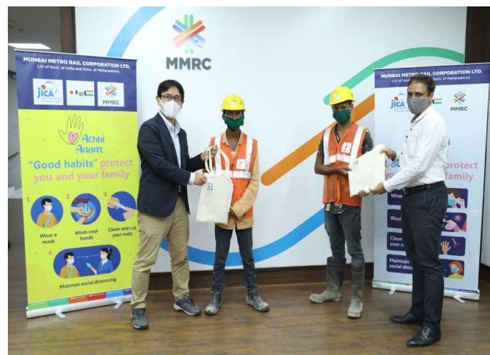
Distribution of Tote Bags, Masks and Soaps at MMRC