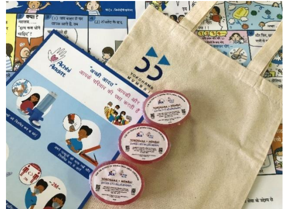
Image of the goods and IEC materials provided