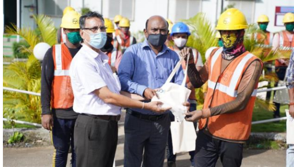
Distribution of Kits in Package 3 at Mumbai Trans Harbor Link Road Project