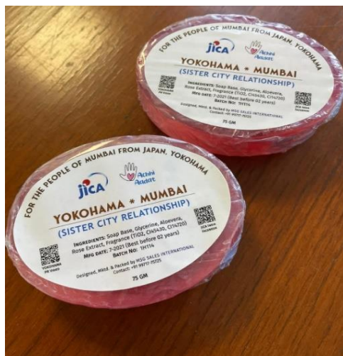
The image of the soaps