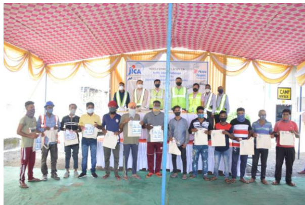
Ceremony in Package 2 for Distribution of Kits at Mumbai Trans Harbor Link Road Project