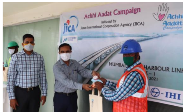
Distribution of kits in Package 1 at Mumbai Trans Harbor Link Road Project